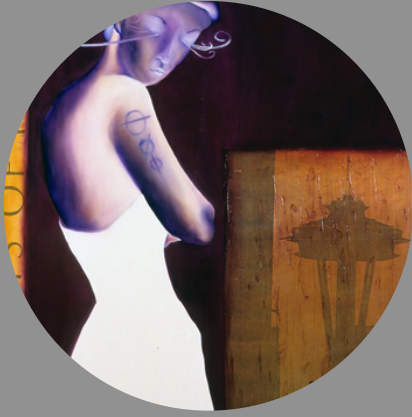
Pockets of Paradise, 2000, 72 x 60 x 2 in., oils, collage and gold leaf