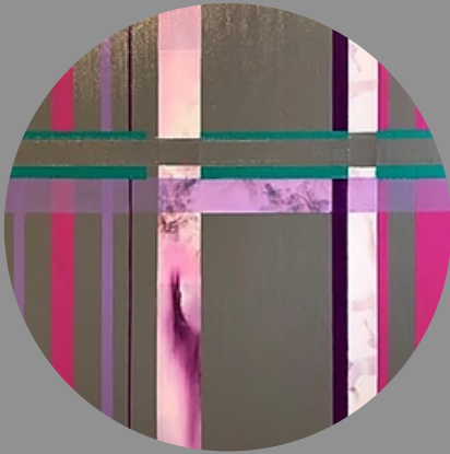
Simone Biles II, February 2020, 20 x 16 x .5 in., acrylic and collage on canvas